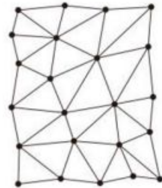
DECENTRALISED (e.g. blockchain)

In a decentralised blockchain database, as shown on the right, the same information is held by each user, and all of the users are interconnected. There is no master copy.